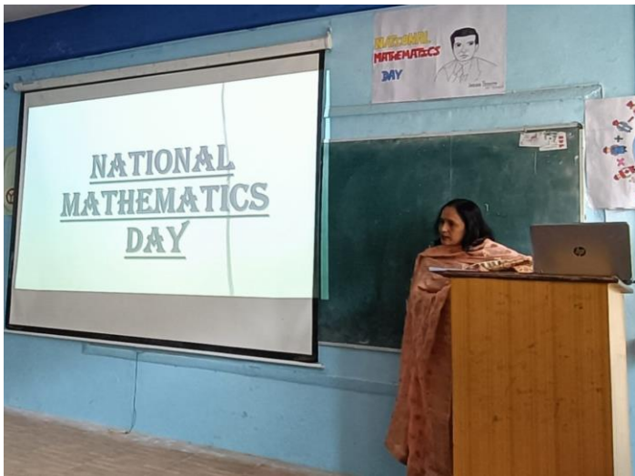
Greeting speech by the coordinator