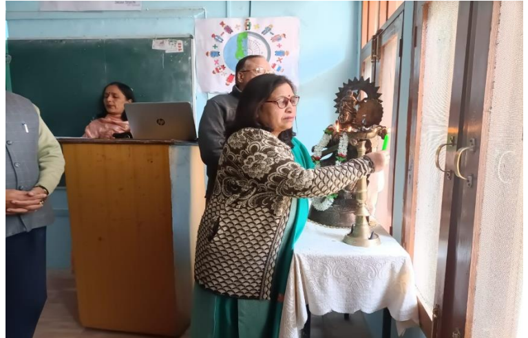
Maa Sarsvati Poojan