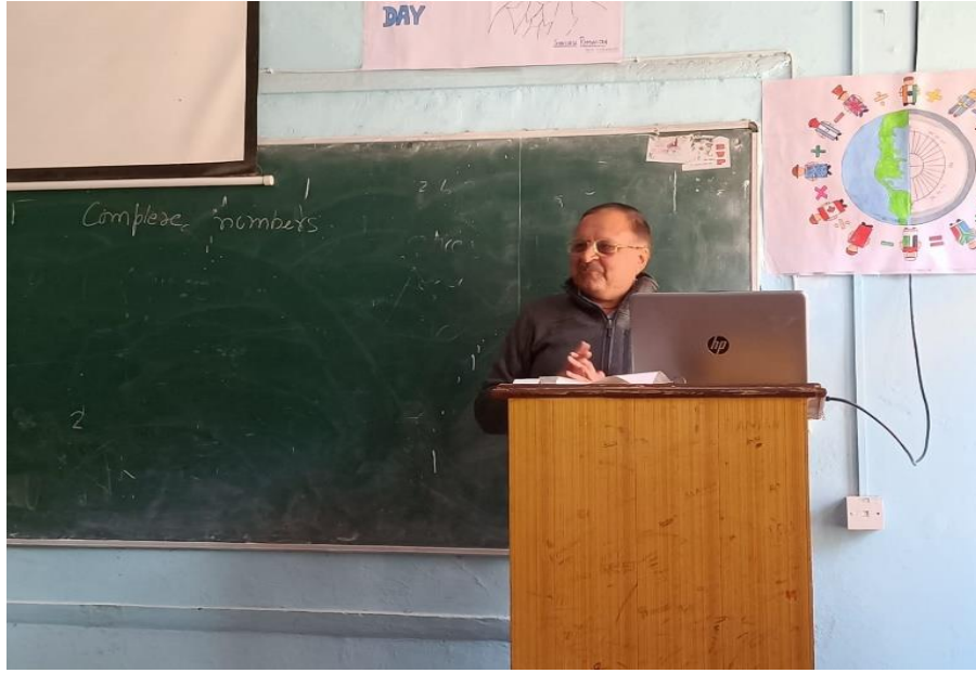
Address by Chief Guest