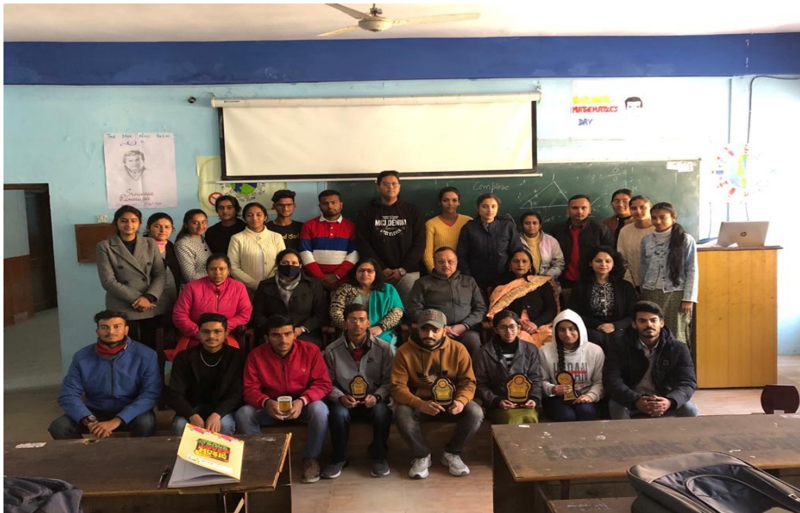
Mathematics society with Chief Guest and faculty members