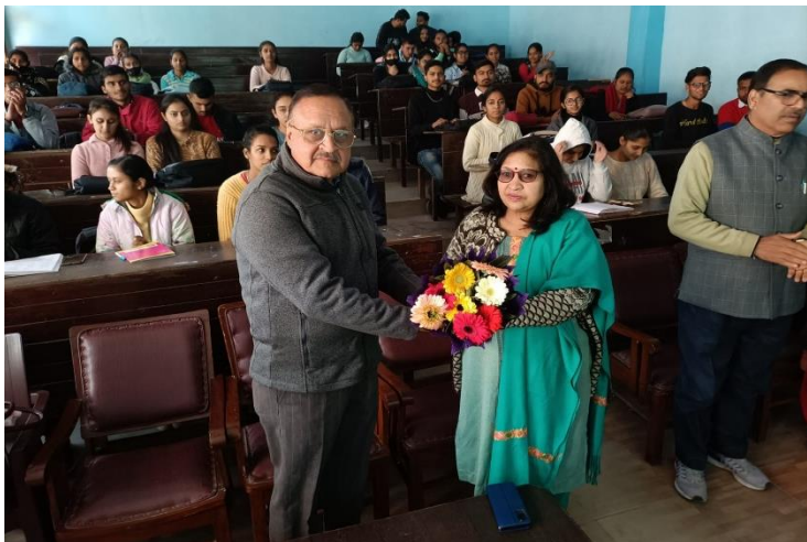
Welcome of Chief Guest